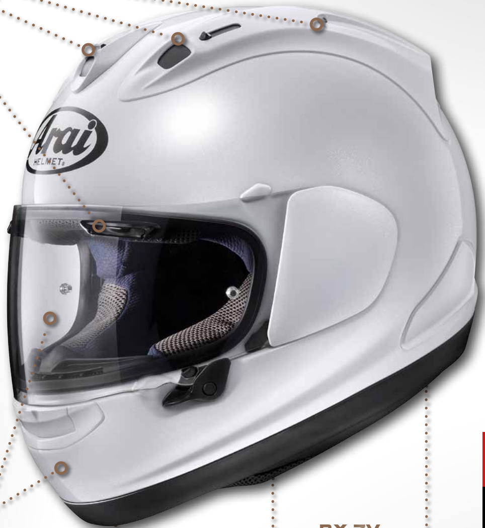
RX-7V Diamond White

** Innovated and exclusively offered by Arai